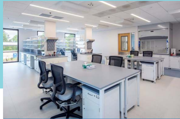
State-of-the-Art Research Laboratories