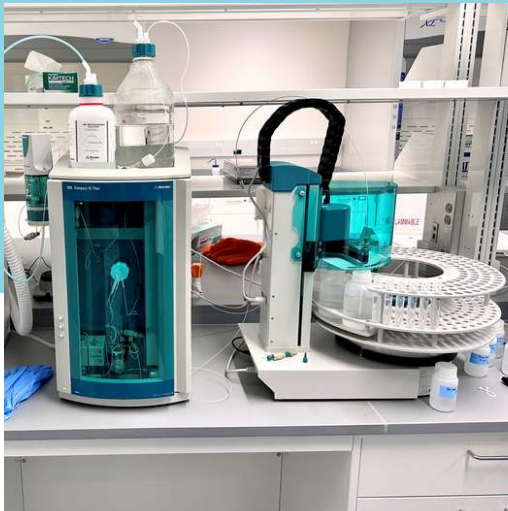
Specialized and Standard Equipment